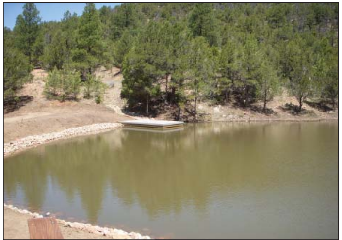
Rancho La Barberia