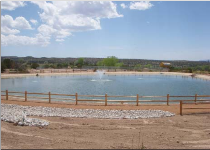
Irrigation Lake - Nambe Pueblo

In May 2010, ACI completed the renovation of a recreational lake on a private ranch near Santa Fe, NM. ACI construction crews dredged sediments and removed organics to make the lake deeper and more accessible. We cleared brush and trees from the dam, raised the water level by modifying the spillway, installed a new bridge, installed a new boat dock, and created access points around the lake. Aeration and artificial habitat were added to the lake and once completed, rainbow trout were stocked. The owners of the ranch are very pleased with the finished product and plan on several summer vacations to the lake.